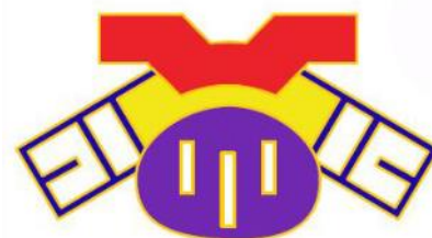
New 2014 Dues on Time pin available at Spring Pow Wow.

Feel free to stop by the trading post if you have other questions