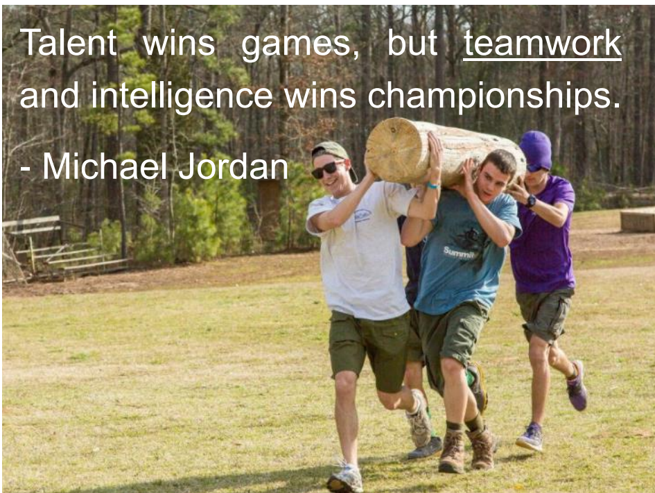
#Camporee2014 ..... CHALLENGE TRAIL