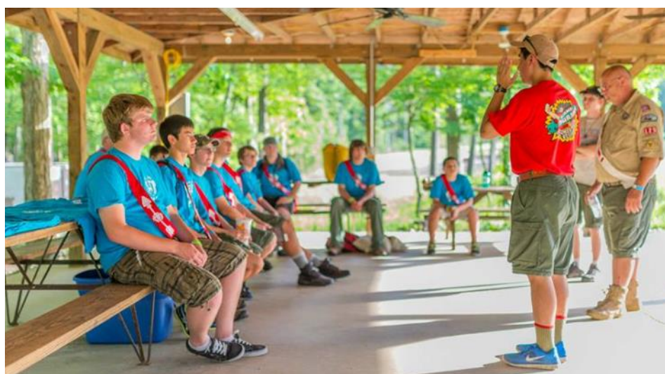
Elangomat gathering, Spring Inductions 2013

Now that you are on board and want to be an Elangomat; you can pre-register on the lodge website now! Just select Elangomat and you can be on your way to impacting the future of our Lodge!