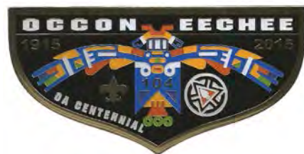
Issue: M-3 Note: OA Centennial