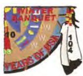
Issue: eX2010-4 Note: Winter Ban.