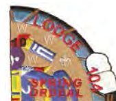
Issue: eX2010-2 Note: Spr. Ord.