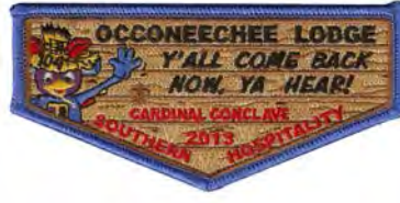
Issue: S-97 Note: 2013 Contingent Flap