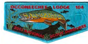
Issue: S-100 Note: Nat'l Jamboree