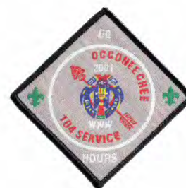
Issue: W-9 Note: 60 Hrs.