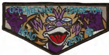
Issue: F-11 Note: Delegate Trader