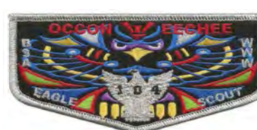
Issue: S-106 Note: Eagle Scout