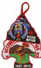
Issue: eA2012-1 Note: Pow-Wow