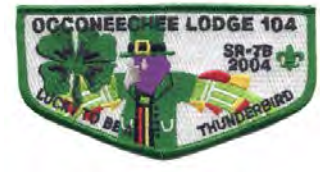
Issue: S-53 Note: Corrected flap