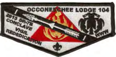
Issue: S-99 Note: VIG Rededication