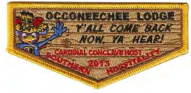
Issue: S-98 Note: 2013 Host Flap