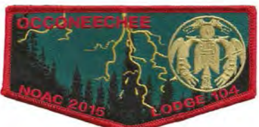
Issue: S-108 Note: '15 NOAC Trader