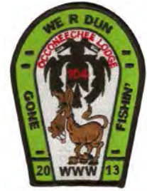
Issue: X-84 Note: Gone Fishin'