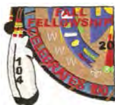
Issue: eX2010-3 Note: Fall Fell.