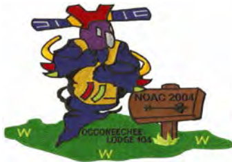
Issue: J-15 Note: NOAC 2004