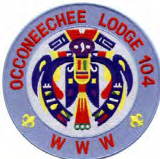
Issue: J-9 Note: 202 mm