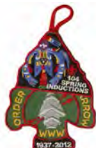
Issue: eA2012-2 Note: Spr. Ind.