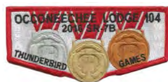
Issue: S-122 Note: Conclave Tdr.