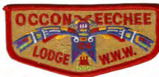
Issue: S-49 Note: 3 equal face line, BRO