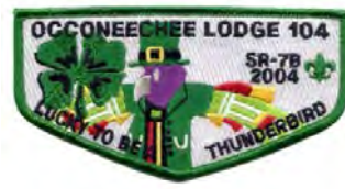
Issue: S-52 Note: "A" in tie, error flap