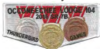
Issue: S-123 Note: Conclave Del.