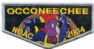
Issue: S-51 Note: NOAC Fund, GRY Bdr