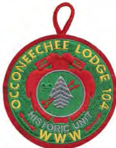
Issue: R-25 Note: Historic Unit