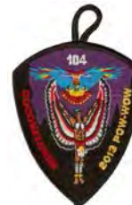
Issue: eX2013-1 Note: Pow-Wow