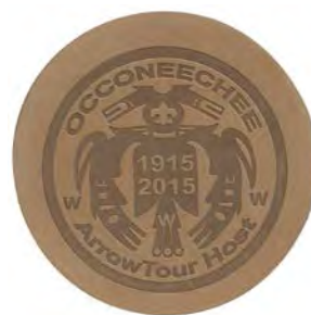
Issue: L-3 Note: ArrowTour Coaster