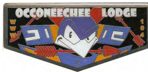
Issue: M-2 Note: 2 nd metal flap