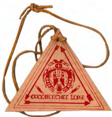
Issue: L-1 Note: Silk-screen design