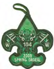
Issue: eX2009-2 Note: Spr. Ordeal