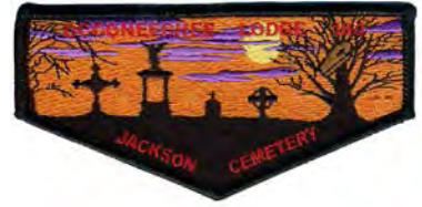
Issue: S-95 Note: Jackson Cemetery