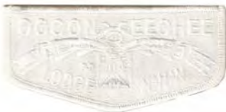
Issue: S-45 Note: Bldg Fund, ORD