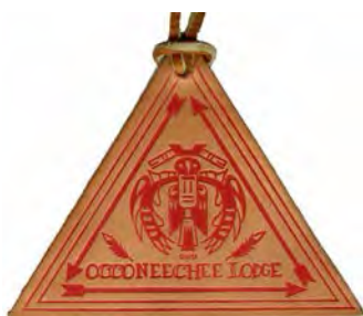
Issue: L-2 Note: Stamped design