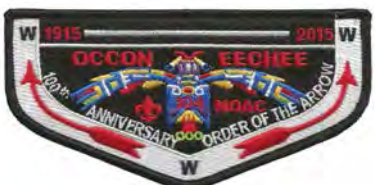
Issue: S-102 Note: NOAC Fundraiser