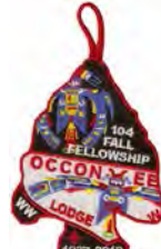
Issue: eA2012-3 Note: Fall Fellowship