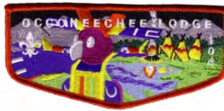
Issue: S-40 Note: Lodge Bldg. Fund