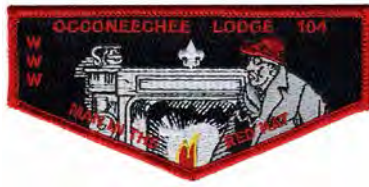
Issue: S-94 Note: Man in the Red Hat