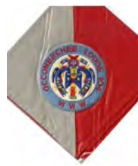
Example "G" w/R-7b