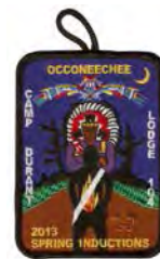
Issue: eX2013-2 Note: Spring Ind.