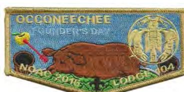
Issue: S-109 Note: '15 Founder's Day