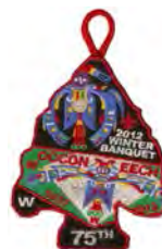
Issue: eA2012-8 Note: W. Banquet