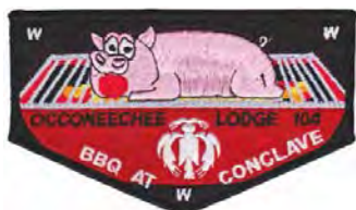
Issue: F-13 Note: Conclave Trader