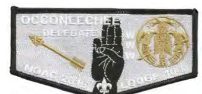
Issue: S-110 Note: '15 NOAC Delegate