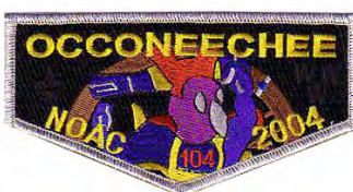
Issue: S-54 Note: Del. Trader, SMY Bdr