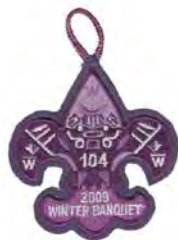
Issue: eX2009-4 Note: Winter Ban.