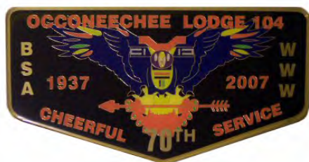
Issue: M-1 Note: Issued for 70 th Anniv.