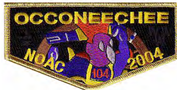
Issue: S-55 Note: Restricted Delegate