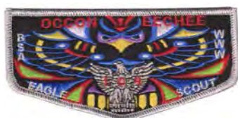
Issue: S-117 Note: Details in Eagle RED 104