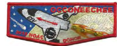
Issue: S-148 Note: Donor ORD Arrow