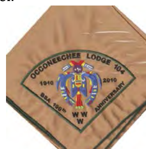
Issue: N-6 Note: BSA 100th