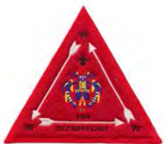
Issue: C-6 Note: Vigil Fund, 2004