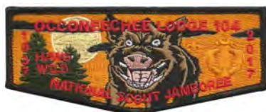
Issue: S-128 Note: Jambo "Web" issue