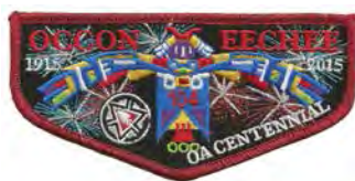
Issue: S-112 Note: OA 100 th ORD