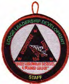
Issue: R-17 Note: LLD Staff