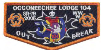
Issue: S-56 Note: "Out Break" theme