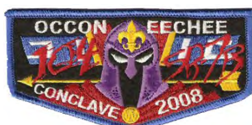
Issue: F-8 Note: BLK felt background