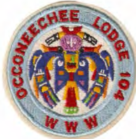
Issue: R-5b Note: BLK/RED touch