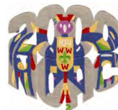
Issue: J-8 Note: 2000 NOAC