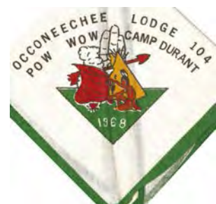
Issue: eN1968-1+ Note: Pow-Wow