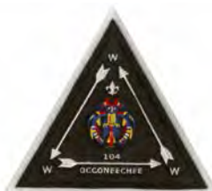
Issue: C-8 Note: Vigil Fund, 2004