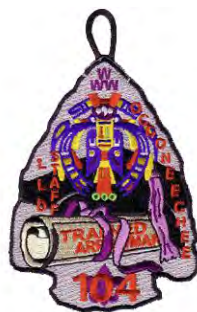
Issue: A-7 Note: LLD Staff