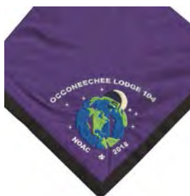
Issue: N-8 Note: 2018 NOAC