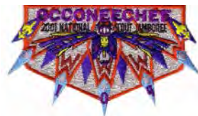
Issue: S-37 Note: '01 Jambo, SMY