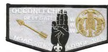
Issue: S-110 Note: '15 NOAC Delegate