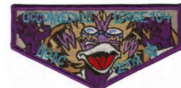
Issue: F-12 Note: Restricted Del.