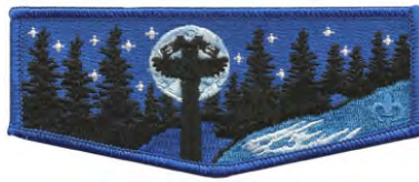
Issue: S-132 Note: CIV Historical Assoc.