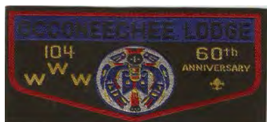
Issue: W-4 Note: 60 th , YEL, ORD