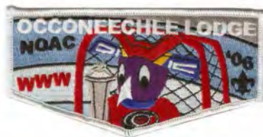
Issue: F-5 Note: Ice is tackle twill