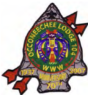
Issue: J-21 Note: 70 th Anniv