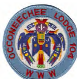
Issue: R-11a Lt BLU Issue: R-11b Dk BLU Note: var. in lock stich