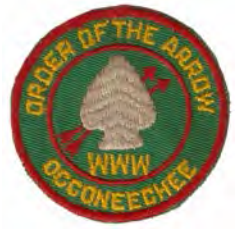
Issue: R-4 Note: "A" & "R"