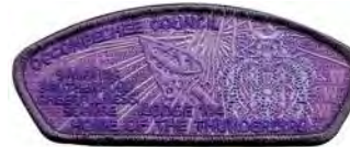
Issue: X-87 Note: PUR Mono CSP