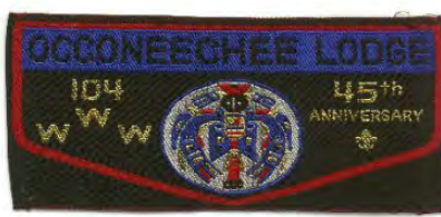
Issue: W-2 Note: 45 th , GMY, BRO