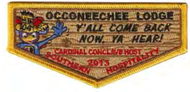
Issue: S-98 Note: 2013 Host Flap