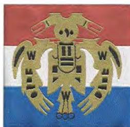
Issue: W-11 Note: '16 Conclave Epaulet