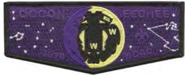
Issue: S-141 Note: 3/4 moon right