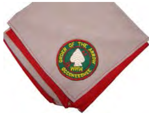
Example "B" w/R-3