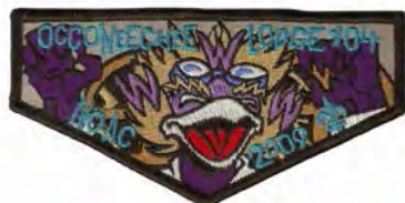
Issue: F-11 Note: Delegate Trader