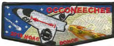
Issue: S-149 Note: Donor BRO Arrow