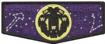
Issue: S-140 Note: Full Moon