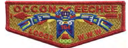
Issue: S-145 Note: BRO w/arrow