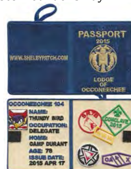
Issue: X-103 Note: Conclave Trader