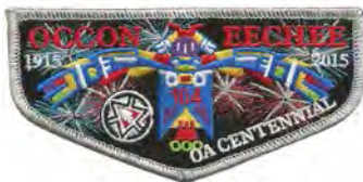
Issue: S-114 Note: OA 100 th VIG