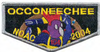
Issue: S-51 Note: NOAC Fund, GRY Bdr