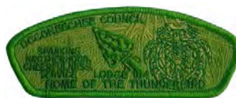
Issue: X-94 Note: Green Mono CSP