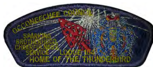
Issue: X-101 Note: Full Color