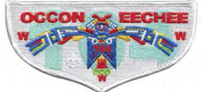
Issue: S-104 Note: 104 th Solid Flap