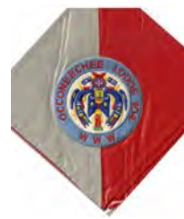
Example "G" w/R-7b