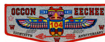
Issue: W-15 Note: VIG SMY 80th Anniv.