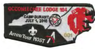
Issue: S-116 Note: Individual #'s