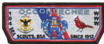
Issue: S-121a Note: Sea Scout "eye"