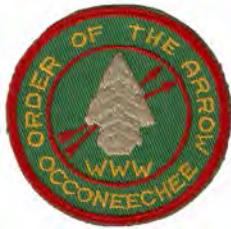
Issue: R-1 Note: WAB issue