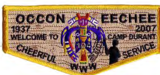
Issue: S-61 Note: 16 hr Conclave workday