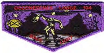
Issue: S-96 Note: Maco Light