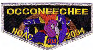
Issue: S-54 Note: Del. Trader, SMY Bdr