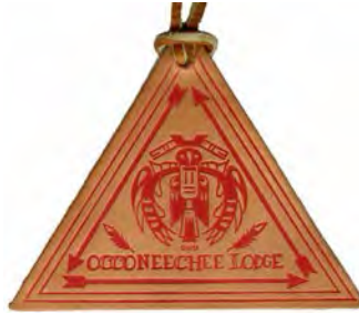
Issue: L-2 Note: Stamped design