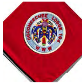
Example "C" w/ R-5