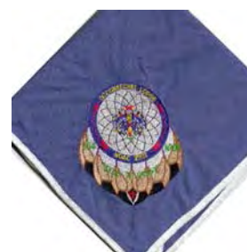
Issue: N-3 Note: '02 NOAC Direct Emb. 1/del.