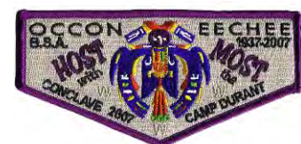
Issue: S-62 Note: Conclave Host