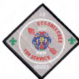
Issue: W-8 Note: 40 Hrs.