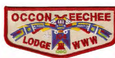
Issue: F-15a Note: Pleather, GRN tail