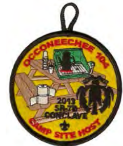
Issue: R-24 Note: Camp Site Host