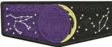
Issue: S-143 Note: 1/4 moon right