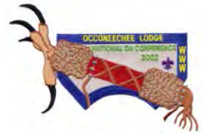
Issue: S-38 Note: "The Claw"