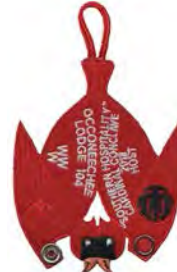
Issue: X-83 Note: Host Cardinal Bat