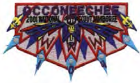
Issue: S-36 Note: '01 Jambo, GRY