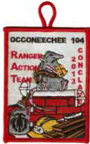
Issue: X-81 Note: '13 R.A.T.'s