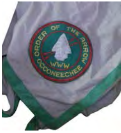
Example "A" w/R-1