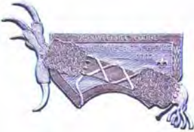
Issue: S-39 Note: NOAC Restricted Del.