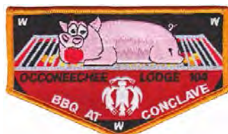
Issue: F-14 Note: Conclave Delegate