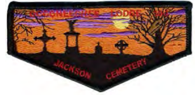
Issue: S-95 Note: Jackson Cemetery