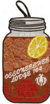
Issue: X-82 Note: Delegate, 1-per