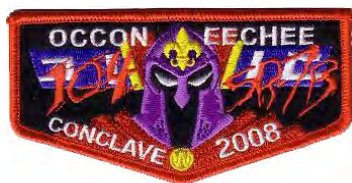
Issue: F-7 Note: BLK felt background