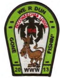
Issue: X-84 Note: Gone Fishin'