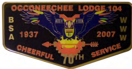
Issue: M-1 Note: Issued for 70 th Anniv.