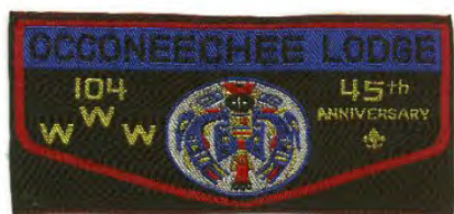
Issue: W-1 Note: 45 th , YEL, ORD