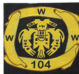
Issue: W-12 Note: '17 Conclave Epaulet