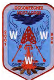
Issue: J-10 Note: '01 Conclave