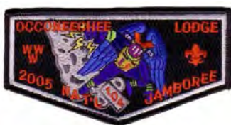
Issue: S-57 Note: '05 Jamboree