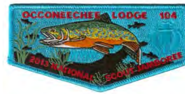
Issue: S-100 Note: Nat'l Jamboree