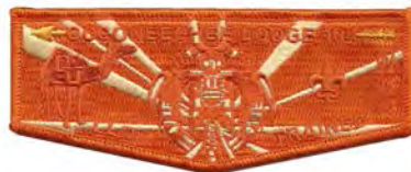
Issue: S-126 Note: LLD Trained ORG Mono