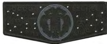
Issue: S-144 Note: New moon delegate