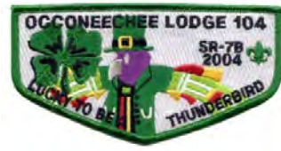
Issue: S-52 Note: "A" in tie, error flap