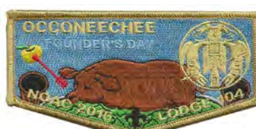
Issue: S-109 Note: '15 Founder's Day