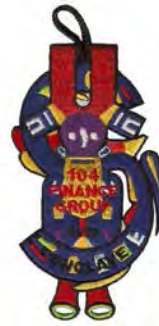
Issue: X-79 Note: '13 Finance Group