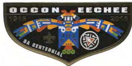
Issue: M-3 Note: OA Centennial