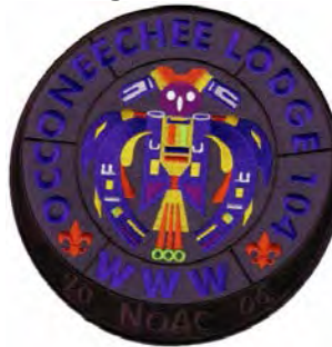
Issue: J-19 Note: Hockey Puck