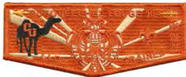
Issue: S-147 Note: LLD Trained