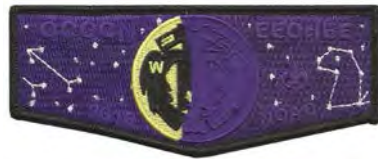
Issue: S-138 Note: 1/2 moon left