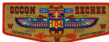
Issue: W-14 Note: BRO GMY 80th Anniv.