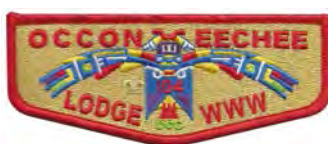
Issue: S-119 Note: 5" x 2" BRO