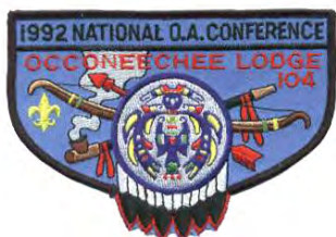
Issue: F-1 Note: '92 NOAC, MVE