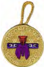
Issue: R-21 Note: '08 Conclave