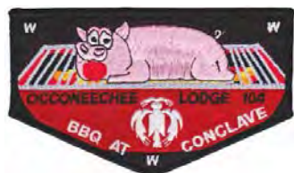
Issue: F-13 Note: Conclave Trader