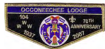
Issue: S-65 Note: 70 th Anniv., BRO