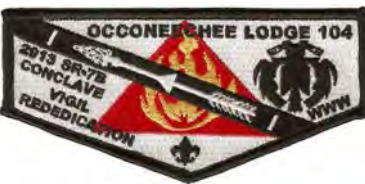
Issue: S-99 Note: VIG Rededication