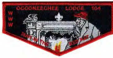
Issue: S-94 Note: Man in the Red Hat