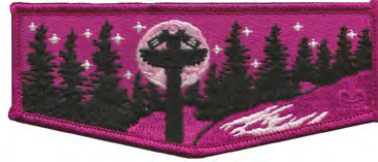
Issue: S-135 Note: CIV Historical Assoc.