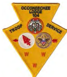
Issue: A-4b Note: Shelby Backing