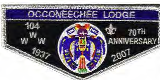
Issue: S-66 Note: 70 th Anniv., VIG