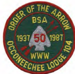
Issue: R-14 Note: 50 th Anniv.