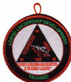
Issue: R-18 Note: LLD Trained