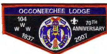
Issue: S-64 Note: 70 th Anniv., ORD