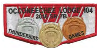
Issue: S-122 Note: Conclave Tdr.