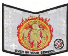
Issue: X-100 Note: '15 Restricted. Del.