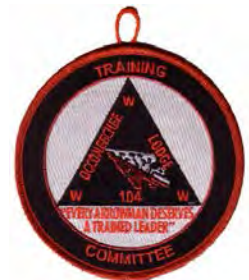
Issue: R-16 Note: Training Committee