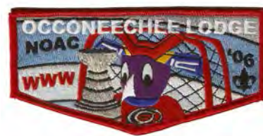
Issue: F-6 Note: Ice is tackle twill