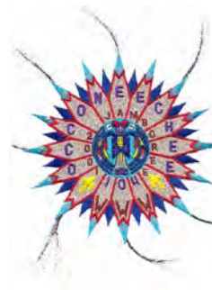
Issue: J-11 Note: Horse Hair, SMY