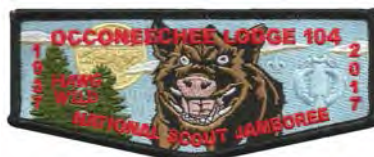
Issue: S-129 Note: Jambo "Event" issue