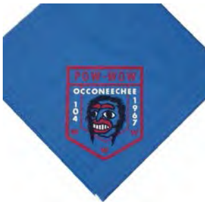
Issue: eN1967-1+ Note: Pow-Wow