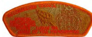
Issue: X-86 Note: ORG Mono. CSP