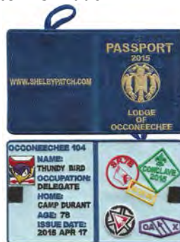
Issue: X-102 Note: Conclave Delegate