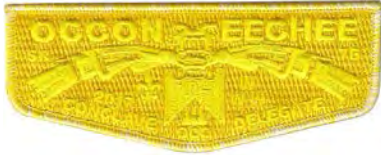
Issue: S-134 Note: Conclave Delegate