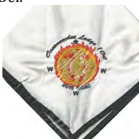
Issue: N-7 Note: 2015 NOAC Delegate Pre-order