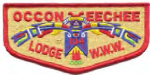
Issue: S-42 Note: Tri-face, BRO