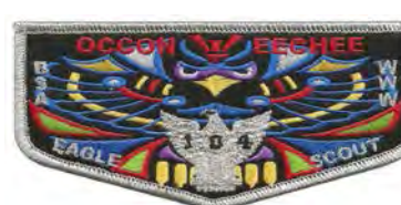
Issue: S-106 Note: Eagle Scout