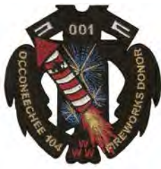
Issue: X-77 Note: Fireworks Donor