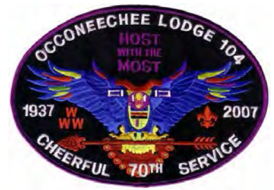
Issue: J-20 Note: 70 th Anniv. & Host