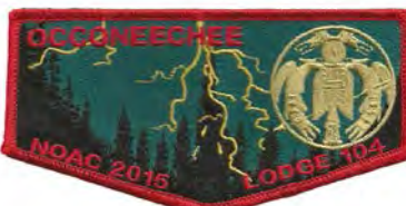
Issue: S-108 Note: '15 NOAC Trader