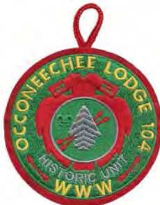
Issue: R-25 Note: Historic Unit