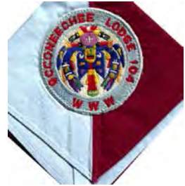
Example "D" w/Trimmed R-5