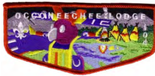
Issue: S-40 Note: Lodge Bldg. Fund