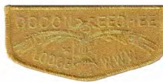
Issue: S-46 Note: Bldg Fund, BRO