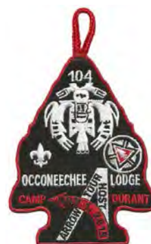
Issue: A-12 Note: ArrowTour