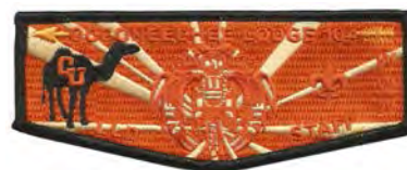
Issue: S-127 Note: LLD Staff