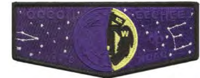
Issue: S-142 Note: 1/2 moon right