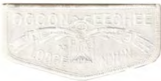
Issue: S-45 Note: Bldg Fund, ORD