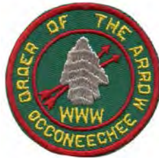
Issue: R-2 Note: "E" & "A"