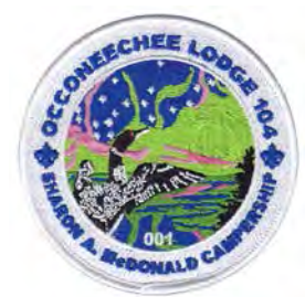
Issue: R-28 Note: '18 Campership