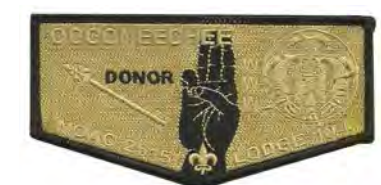
Issue: S-107 Note: 2015 NOAC Donor