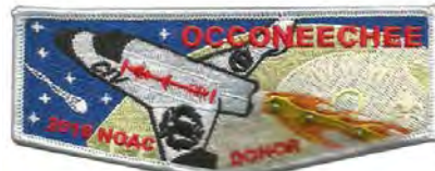
Issue: S-150 Note: Donor VIG Arrow