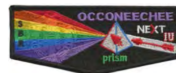
Issue: S-124 Note: Prism/Next