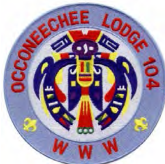
Issue: J-9 Note: 202 mm