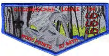
Issue: S-93 Note: Hoof Prints at Bath