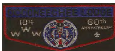
Issue: W-5 Note: 60 th , GMY, BRO