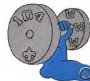
Issue: X-111 Note: Goes w/F-18