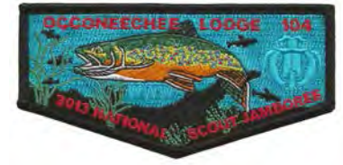
Issue: S-101 Note: Collector's Flap