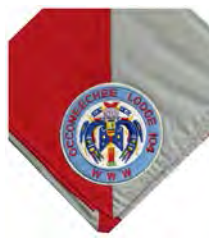
Example "F" w/ R-6