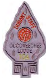
Issue: A-3b Note: Moritz