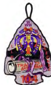
Issue: A-6 Note: LLD Participant