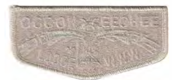
Issue: S-47 Note: Bldg Fund, VIG