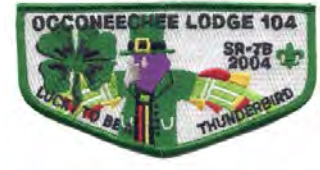
Issue: S-53 Note: Corrected flap