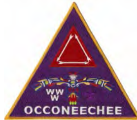
Issue: J-16 Note: 1 st Vigil JP