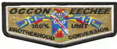
Issue: S-131 Note: 100% Bro Unit