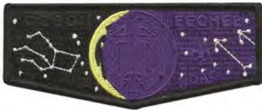
Issue: S-137 Note: 1/4 moon left