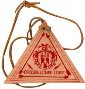
Issue: L-1 Note: Silk-screen design