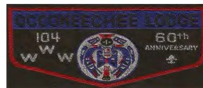
Issue: W-6 Note: 60 th , SMY, VIG