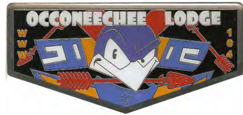
Issue: M-2 Note: 2 nd metal flap