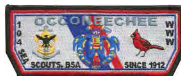
Issue: S-121b Note: Sea Scout "no eye"