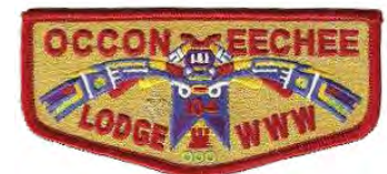
Issue: S-68a (logo PB) Issue: S-68b (clear PB) Note: BRO, '08, Shelby Patch