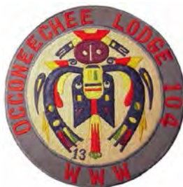
Issue: J-2 Note: Chapter issue from Fayetteville area, numbered