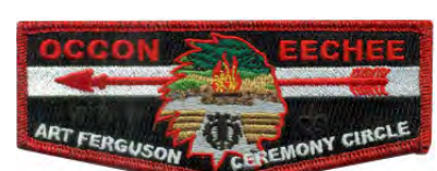
Issue: S-151 Note: Ferguson RMY Bdr.