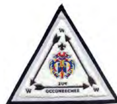
Issue: C-9 Note: Vigil Fund, '04