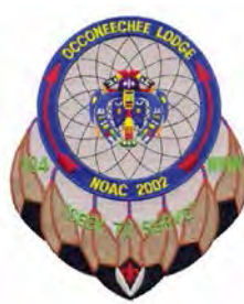
Issue: J-13 Note: '02 NOAC