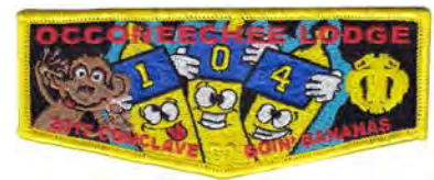
Issue: S-133 Note: Conclave Trader