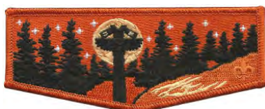
Issue: S-125 Note: CIV Historical Assoc.