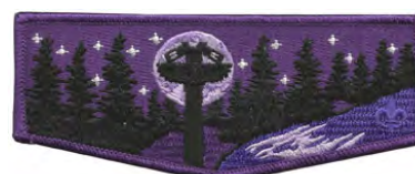
Issue: S-130 Note: CIV Historical Assoc.