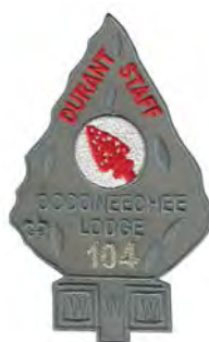
Issue: A-11 Note: Durant Staff (2013)