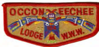
Issue: S-49 Note: 3 equal face line, BRO