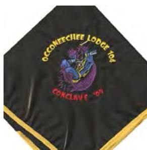
Issue: N-5 Note: '09 Conclave "Super Hero" Theme