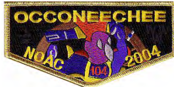
Issue: S-55 Note: Restricted Delegate