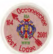
Issue: C-4 Note: Host Lodge Chenille