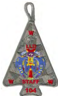
Issue: A-8 Note: LLD Staff, Issued 2011