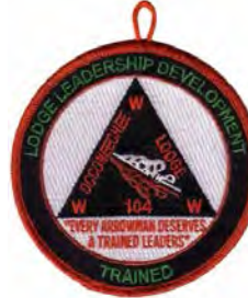
Issue: R-19 Note: "Trained" no FDL