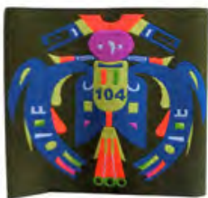
Issue: W-16 Note: D. Green Epaulet