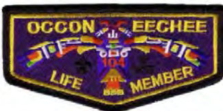
Issue: S-60 Note: Life Member