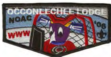
Issue: F-4 Note: Ice is tackle twill