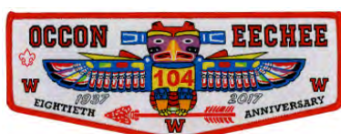
Issue: W-13 Note: ORD WHT 80th Anniv.