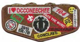
Issue: S-111 Note: Conclave Flap (MVE)