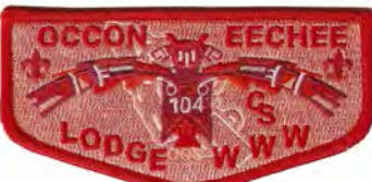
Issue: S-73 Note: "Charley" RED