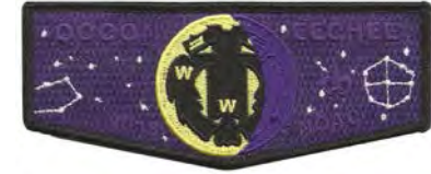
Issue: S-139 Note: 3/4 moon left