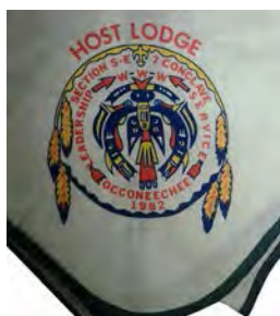
Issue: N-2 Note: Silk Screen '82 Host