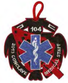
Issue: X-80 Note: '13 Medical Staff