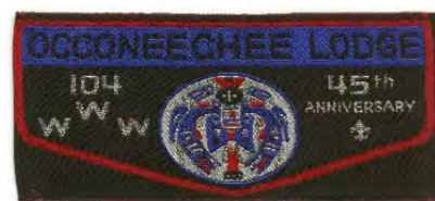
Issue: W-3 Note: 45 th , SMY, VIG