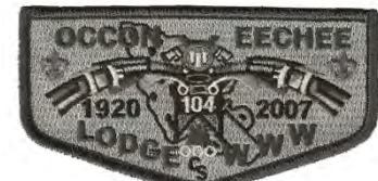
Issue: S-74 Note: 1920-2007, GRY