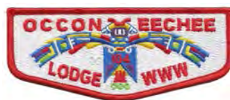
Issue: S-118 Note: 5" x 2" ORD