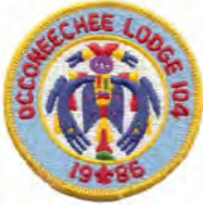
Issue: R-13 Note: 1986