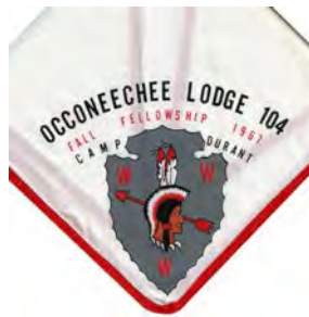
Issue: eN1967-2+ Note: Fall Fellowship