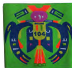
Issue: W-18 Note: Lime GRN Epaulet