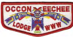
Issue: S-67a (logo PB) Issue: S-67b (clear PB) Note: ORD, '08, Shelby Patch