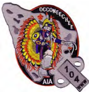
Issue: J-18 Note: 1 st AIA JP