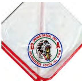
Issue: eN1971-2+ Note: Spring Ordeal