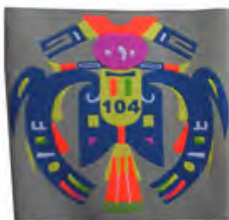
Issue: W-17 Note: Gray Epaulet