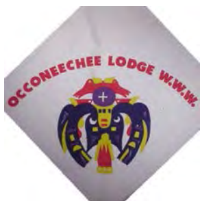
Issue: N-1 Note: Silk screened