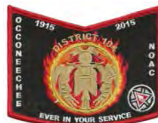
Issue: X-98 Note: '15 Trader