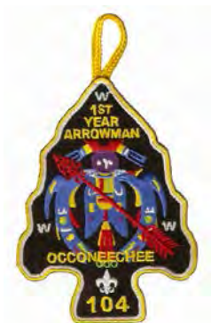
Issue: A-10 Note: First Year Arrowman