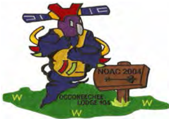
Issue: J-15 Note: NOAC 2004