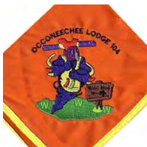
Issue: N-4 Note: '04 NOAC Direct Emb. 1/ Del.