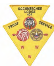
Issue: A-2 Note: MGM