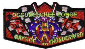
Issue: S-59 Note: 2006 Conclave