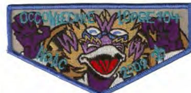
Issue: F-9 Note: GRY felt bkg.