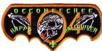
Issue: S-63 Note: MVE Bdr. Color