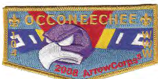
Issue: S-69 Note: '08, ArrowCorps5