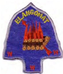
Issue: A-0.5 Note: Elangomat, no name