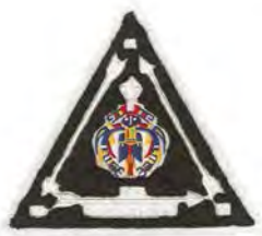
Issue: QC-1 (Dumpster Chenille) Note: Mistake of C-8 Chief was supposed to destroy Found in dumpster @ Campbell Univ.