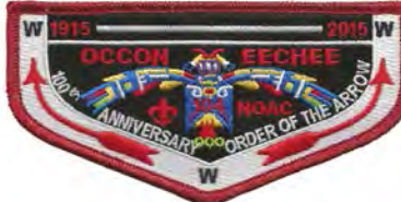
Issue: S-103 Note: NOAC Fundraiser