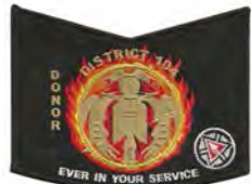
Issue: X-97 Note: '15 Donor