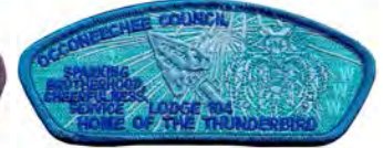
Issue: X-88 Note: Blue Mono CSP