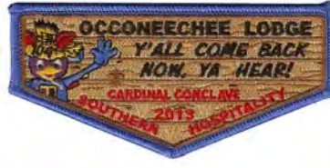
Issue: S-97 Note: 2013 Contingent Flap