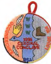
Issue: R-15 Note: '98 Conclave Del.