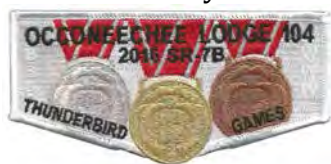
Issue: S-123 Note: Conclave Del.