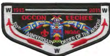
Issue: S-102 Note: NOAC Fundraiser