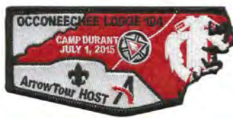
Issue: S-115 Note: ArrowTour Host