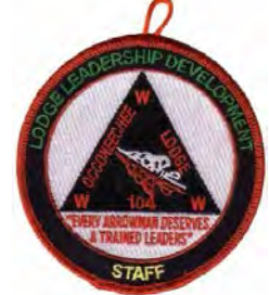
Issue: R-20 Note: "Staff" no FDL