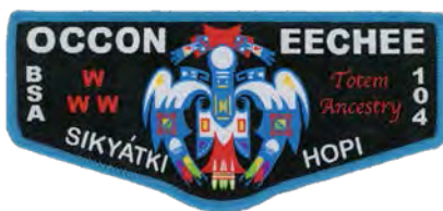
Issue: W-20 Note: Hopi Totem Ancestry