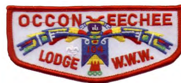
Issue: F-3 Note: White Twill