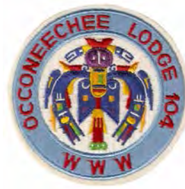
Issue: R-7a Note: Wide felt Bdr