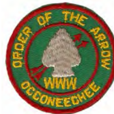
Issue: R-3 Note: Space & "R"