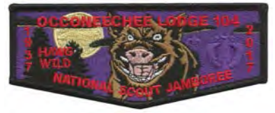
Issue: S-136 Note: Jambo "Contingent"