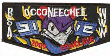
Issue: F-10 Note: Felt background