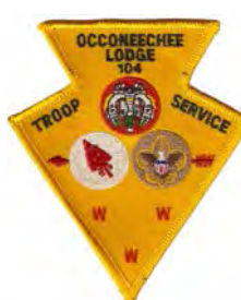
Issue: A-4a Note: Southern Emblem